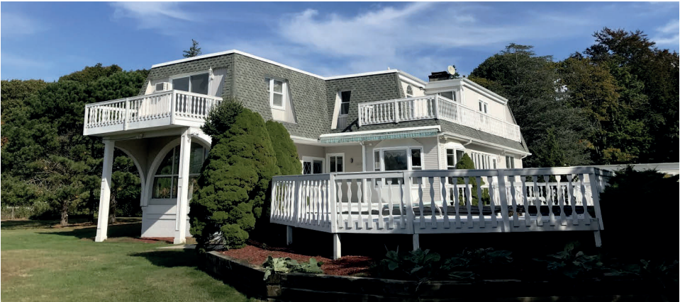
Center Moriches—$799,900 Spacious 4 bedroom, waterfront home on Areskonk Creek. 200 ft. bulkhead with dock and boat lift.