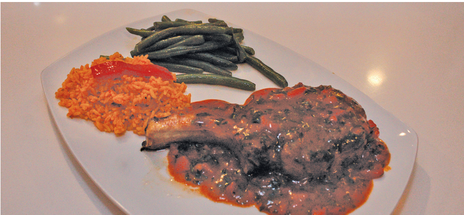
The pork chop is served with a light but flavorful garlic sauce.

stuffed with goat cheese ($14). The date brings a sweetness to the table as the vehicle for really thick goat cheese that melts perfectly and seared bacon that easily rips apart when you bite into it. There’s a rich, complex combination of flavors that makes this something you won’t want to stop grabbing for. There’s also stuffed mushrooms containing shrimp and scallops ($12) that put a little twist on the classic appetizer. We also enjoyed the lamb chops ($15), which were tender and juicy. Freck said he also keeps a good stock of quality Spanish wines. For inquiries about catering or renting the space, call 631-909-1985. ■