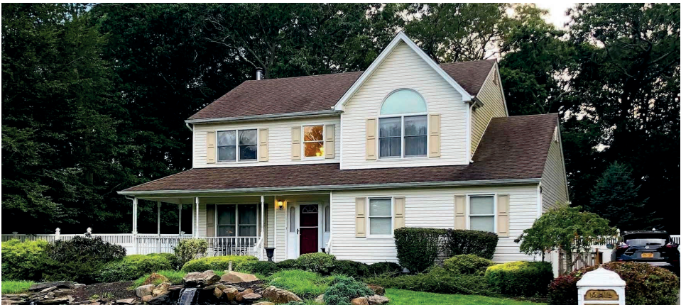
Baiting Hollow—$539,000 Spacious 3 bedroom, 2.5 bath beautifully kept home on Long Island's desirable North Fork.