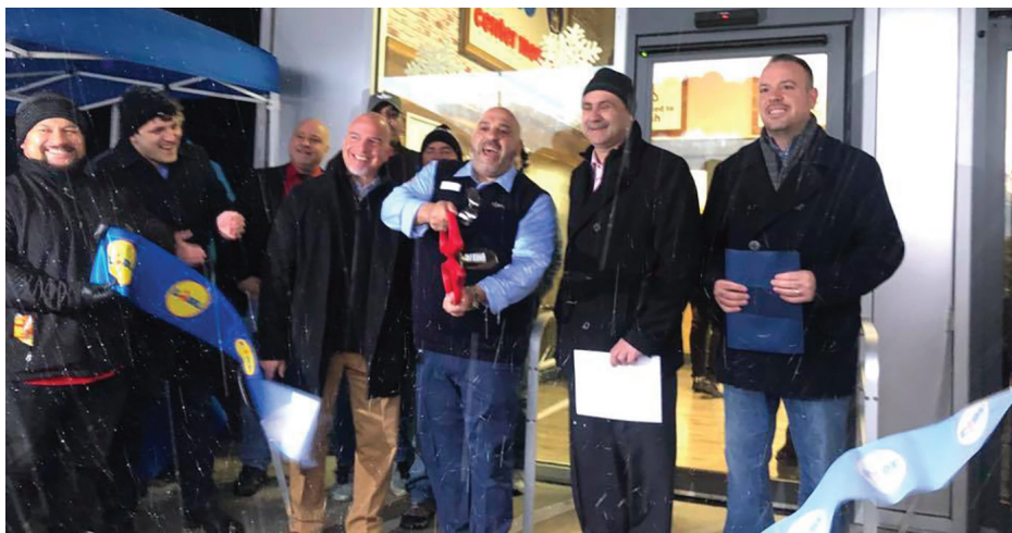
Local elected officials, employees, and residents cut the ribbon to welcome Lidl to the community.