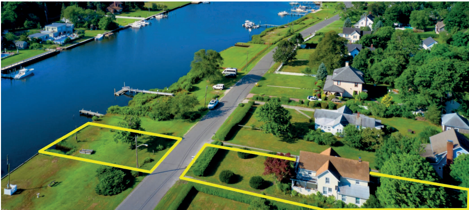
Center Moriches—$699,900 Classic 4 bedroom, 2 bath waterfront Victorian farmhouse on 2.5 acres. Great water views!