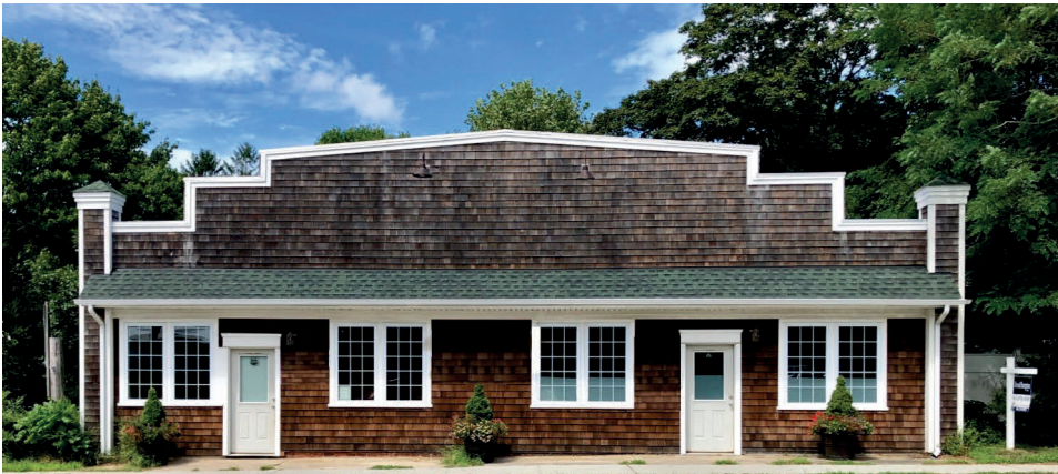
East Moriches—$599,000 Commercial property in prime East Moriches Main Street location. 2 storefronts with storage above.