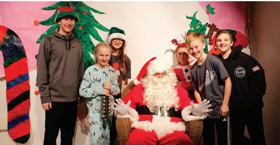
Students from the Center Moriches art club join with Santa as he waits to hear from children who want presents.