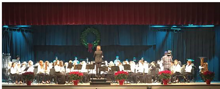
Center Moriches Middle School Band placed first in News 12's annual Sounds of the Season competition, held last month.