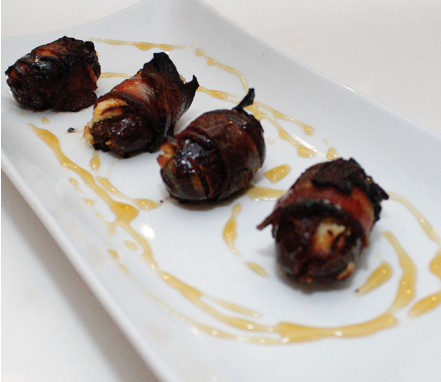
The bacon-wrapped dates stuffed with goat cheese are the perfect savory appetizer.