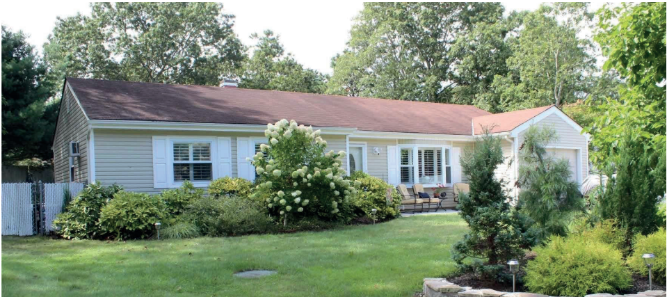
Ridge—$329,000 Well maintained, move-in ready 3 bedroom ranch on quiet block. Private backyard with beautiful Koi pond.